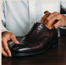
PLACE SHOE TREES