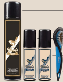
A PROTECTOR PRESTIGE