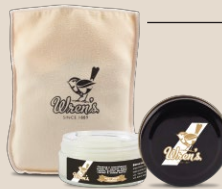
A POLISHING MITTEN CLASSIC