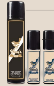
A PROTECTOR PRESTIGE