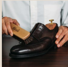
CLEAN SURFACE DIRT