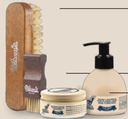
A GLOSS BRUSH CLASSIC